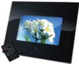
Digital Photo Frame