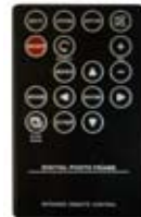
IR Remote Control